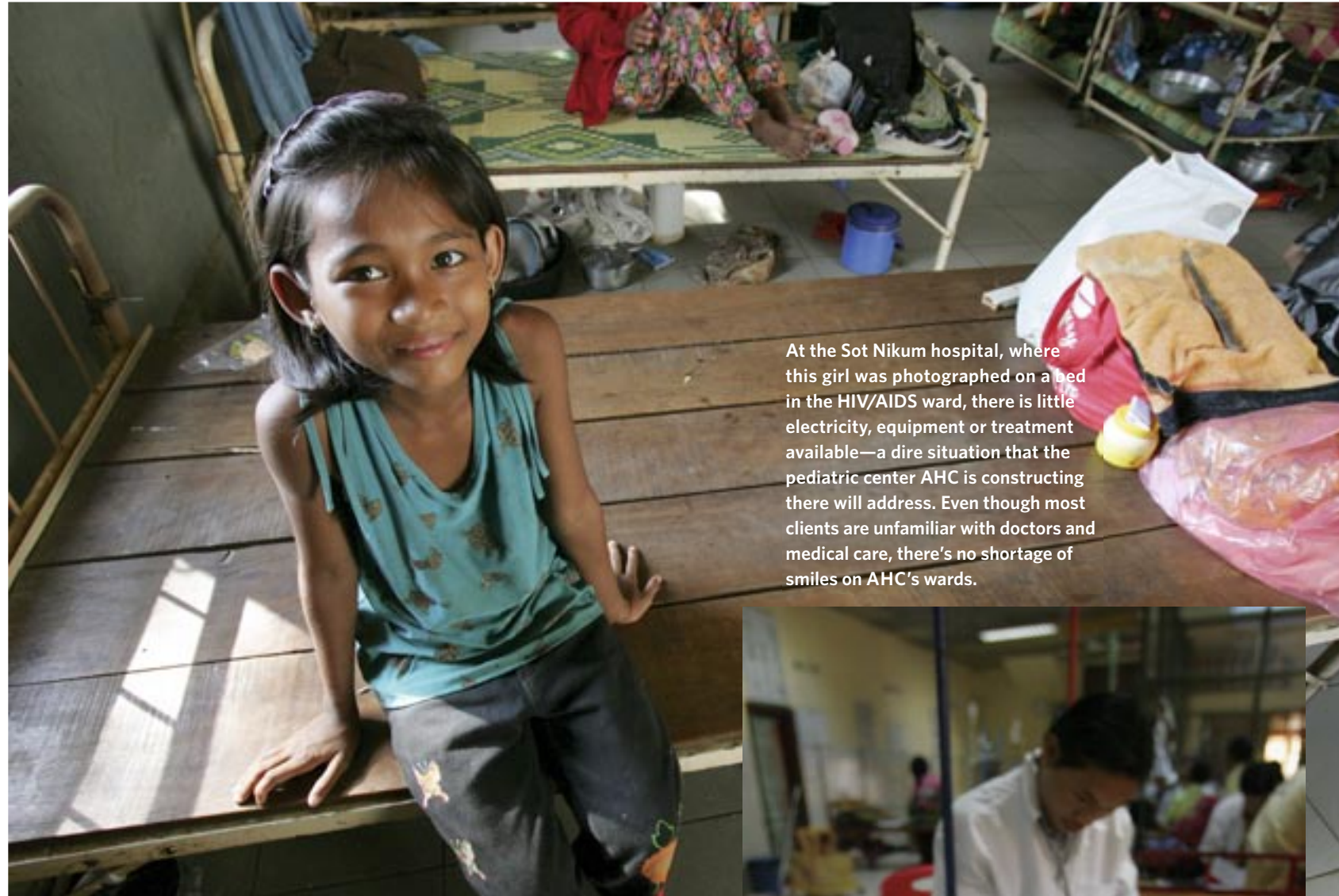
At the Sot Nikum hospital, where this girl was photographed on a bed in the HIV/AIDS ward, there is little electricity, equipment or treatment available—a dire situation that the pediatric center AHC is constructing there will address. Even though most clients are unfamiliar with doctors and medical care, there's no shortage of smiles on AHC's wards.

I am, too, but not only by the hospital. While doing stories for Town & Country , I've observed scenes of extreme deprivation in India, Nepal, Egypt and other places, but usually there were indications close by of a significantly higher standard of living. On this, my first trip here, it doesn't take long to register that in Cambodia, where nearly one-third of the population of fifteen million people are trying to survive on less than $1 a day, there are relatively few such signs; almost everyone, especially in the countryside, appears to be destitute or not far from it. If you want a new perspective on the term economic crisis , a visit here will give you one. When we stop by his house, even my private tour guide, twenty-three and very well-educated, with a good command of English and a comparatively high-paying job, turns out to have only two shirts besides the one he is wearing. I have more stuff in my shoulder bag for the day than he has in the small pile of pos-